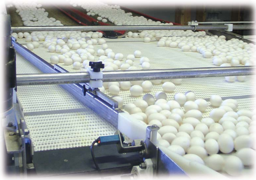
Accumulator Table for Egg Transport